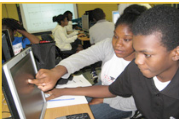
Community Based Programs