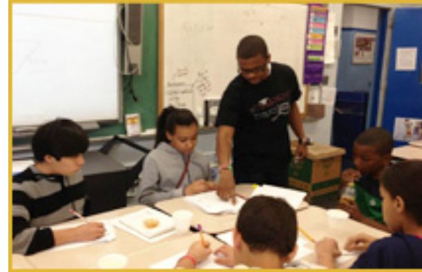
In School Programs

The Parris Foundation (TPF), founded December of 2009, is a designated 501c3 that was established to close the achievement gap in academic performance between disadvantaged and privileged students in Science, Technology, Engineering, and Math (“STEM”). Students are provided with the tools they need to pursue STEM disciplines academically and professionally.